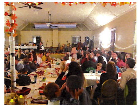
An October wedding