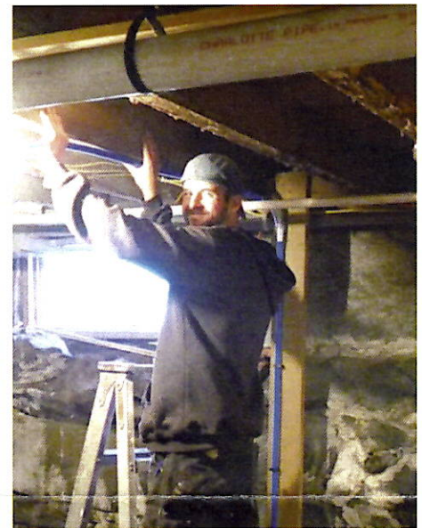
Down in the basement . . .

we raise the money for the matching grant. All of this work brings us that much closer to the last remaining question on many people's minds: when do we finish painting the outside of the Old Town Hall? This may be a work in progress, but a lot of progress has been made as we revitalize and preserve the historic character of this cherished building. Thanks to your generous donations and volunteer efforts, we are getting close to that long-awaited exterior paint job.