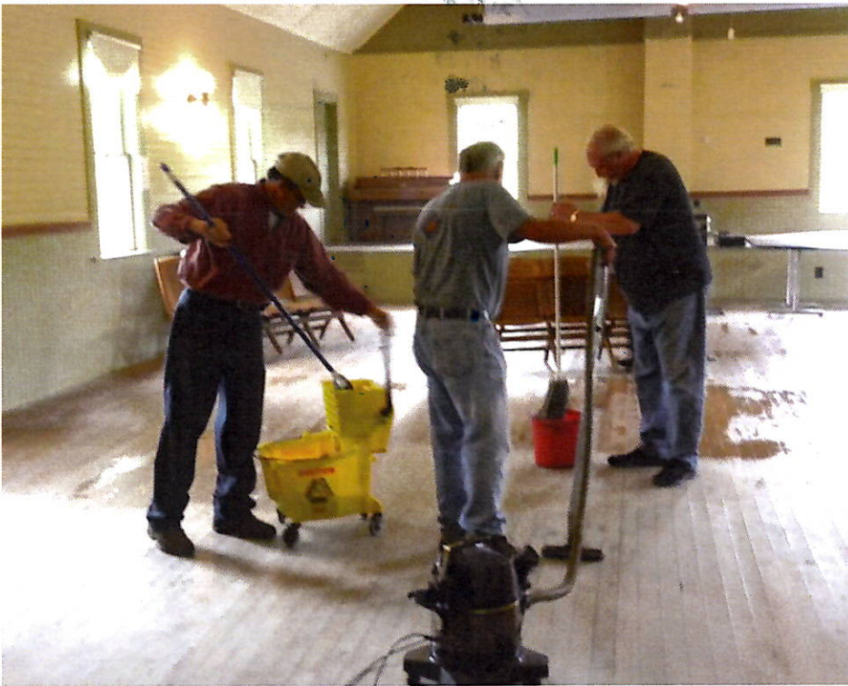
Caution: Men at work