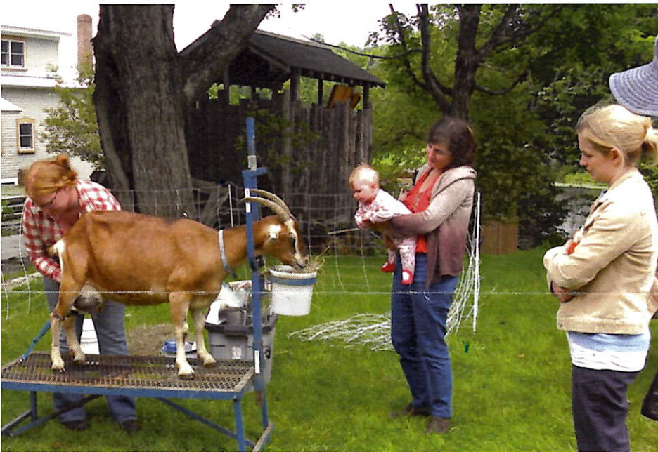
Sharing a Market Day moment

A newsletter to inform, celebrate, promote and contribute to the community of Brookfield.