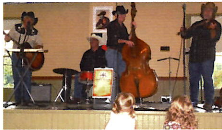
Foot-stompin' music like the old days

Our annual attendance continues to grow and pull from a variety of communities and the continued sponsorship of local businesses helps make it all possible. (See our list of business sponsors elsewhere in this newsletter.) We are especially grateful to the Frankenburg Agency of Randolph serving as our cornerstone sponsor once again. But most of all, we cherish the enthusiasm that you bring to the Brookfield Old Town Hall. See you again next summer!