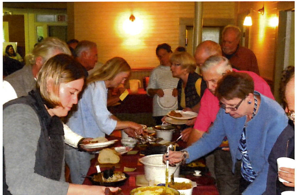
Hard to wait your turn at the pot luck supper