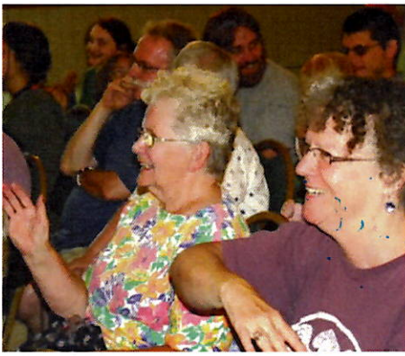
Everyone loves the marionettes!