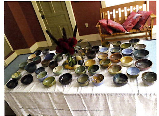
Third Branch Pottery bowls ready for the Souper Supper

events continues to grow, and the number of folks wanting to jump in to help out is also on the rise. Your events committee is still enthusiastic, and welcomes more new members for next year. We hope you’ll think about jumping in – it’s a lot of fun!