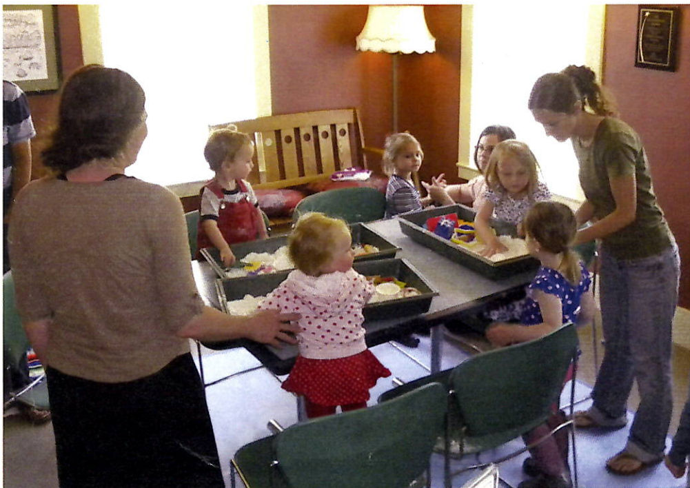
Activities for little ones while others visited at Kickoff Community Potluck