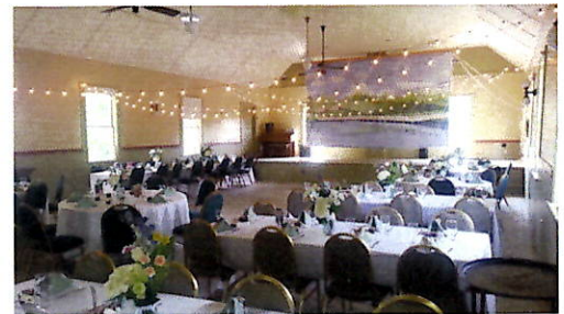
More rental decoration possibilities

Please let your family members, friends, and neighbors know about the opportunity to use our lovely site for events and meeting.