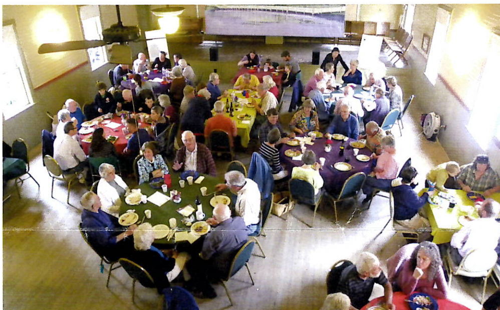
Community Pot Luck Supper