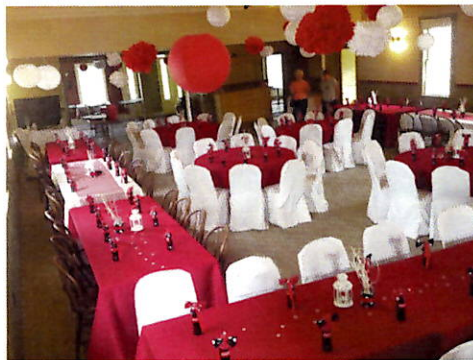
So many possibilities for rental decorations

All of these projects were contracted out to professional restorationists, thanks to the VDHP grant, a grant from the Lamson Howell Foundation and matching funds from the citizens of Brookfield!