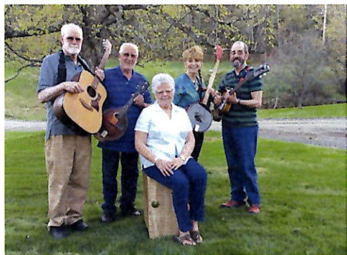
The Bear Mountain Jammers joined us in July