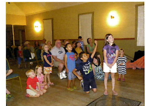
Audience is always wrapped up in the show

On Saturday evening the Bear Hill Jammers provided music for a lively dance session in the auditorium. The following afternoon the “Flowting” Bridge Band closed the two-day celebration with a concert, followed by joyful dancing.