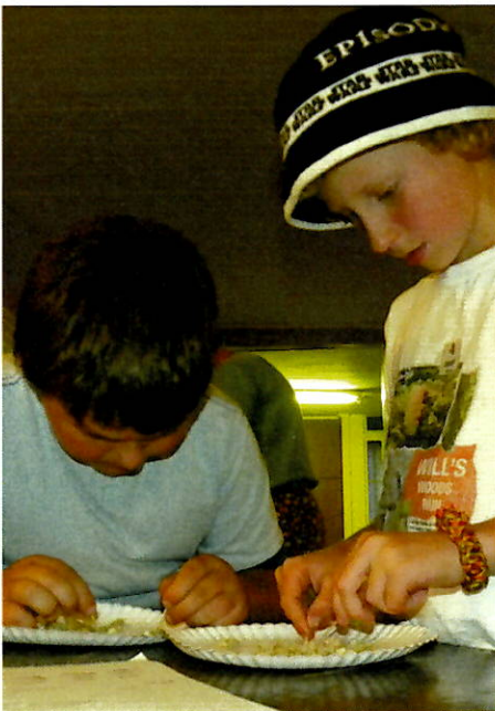
Owl pellet intensity