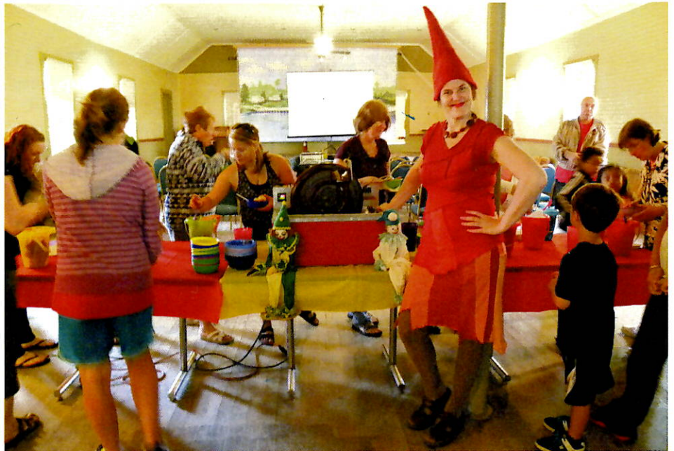
A chocolate extravanza!