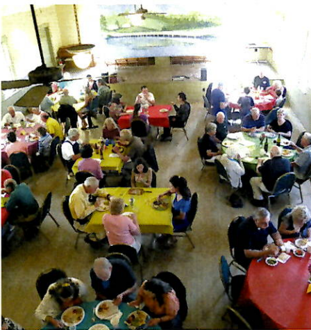
June pot luck filled the hall

A newsletter to inform, celebrate, promote and contribute to the community of Brookfield.