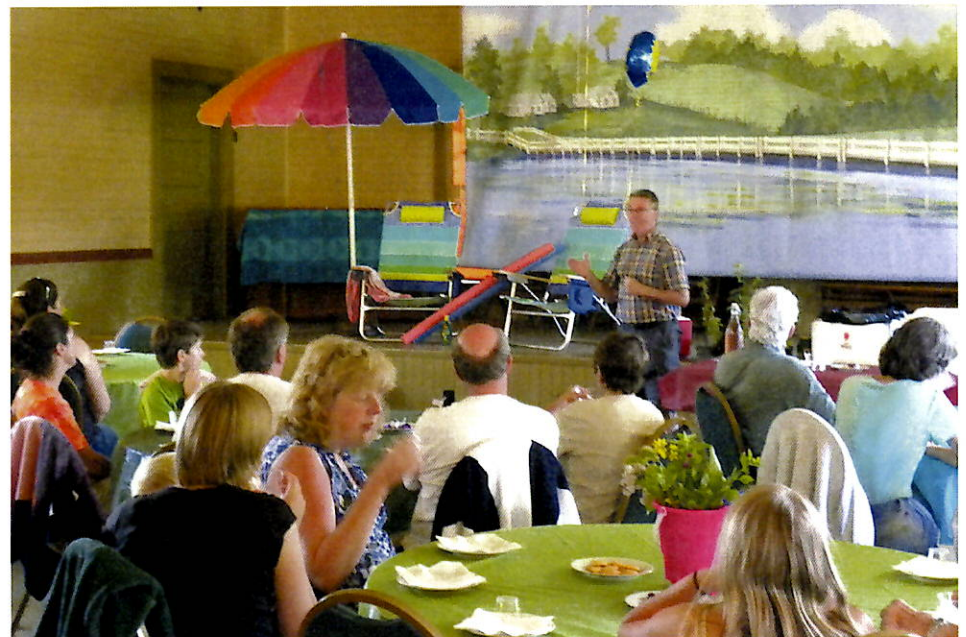
Tasting iced tea at the "beach"