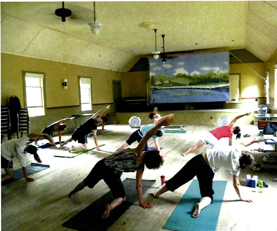
Yoga at the Old Town Hall