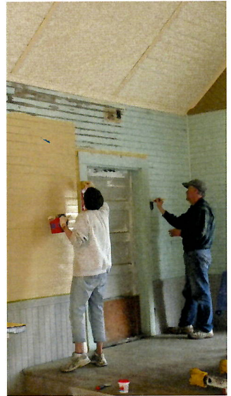
Say good-bye to the "old" town hall!

Thanks to all who have helped us get this far – we owe a debt of gratitude to you for helping us toward our revival of this great old landmark!